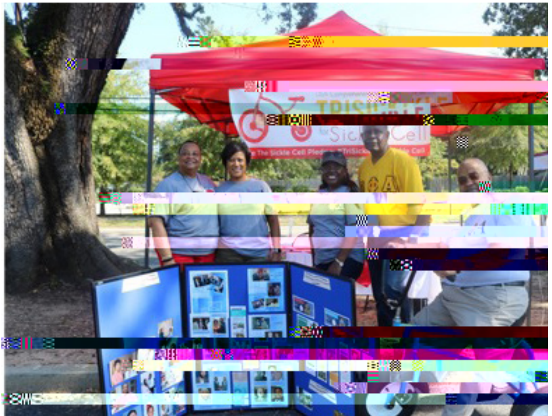
TRISICKLE for Sickle Cell Campaign

As a result of mandatory newborn screening, penicillin prophylaxis, and pneumococcal vaccines, the life expectancy of babies born with sickle cell disease (SCD) in the United States has improved to the 4th and 5th decades of life. While survival with SCD has improved, one-third of adolescents and young adults delay or do not successfully transition to adult care and are lost to medical follow-up for the management of their SCD and