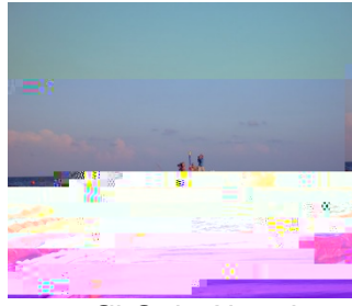
Oil Only Absorbent Booms