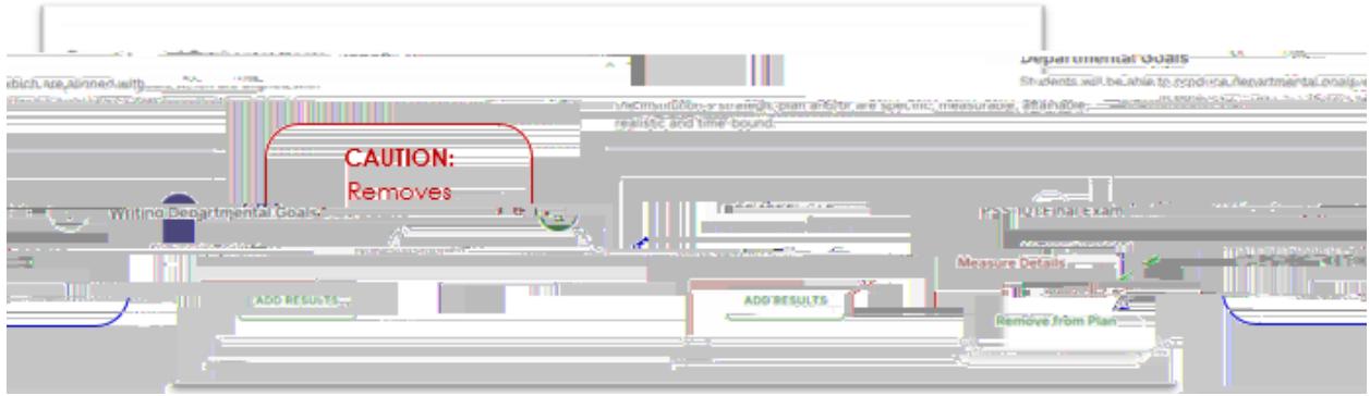
Figure 2: Options for measures associated with an outcome.