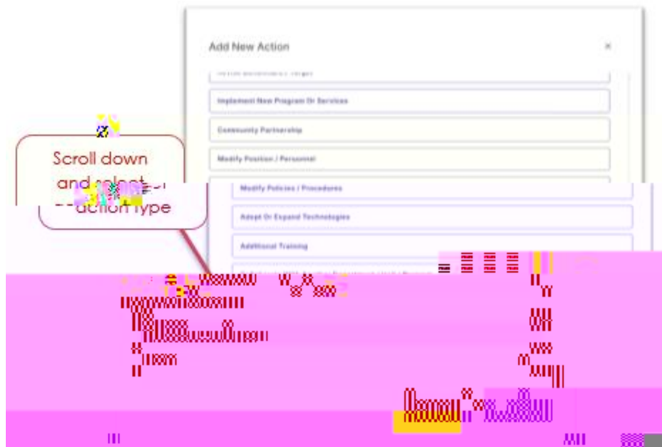
Figure 5: Select an action type "Maintain Assessment Strategy."

When you select an Action Type, a new window will open where you are