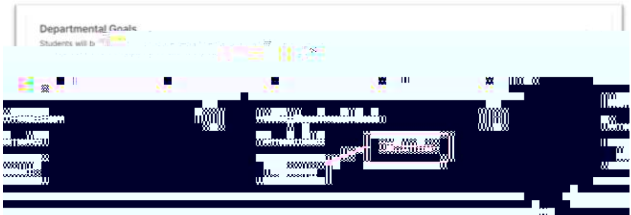
Figure 3: Accessing the "Measure" page for a specific measure.

To report this, click on the ADD RESULTS button under the measure. (See Figure 3.) This will take you to the "Measure" page for this measure.