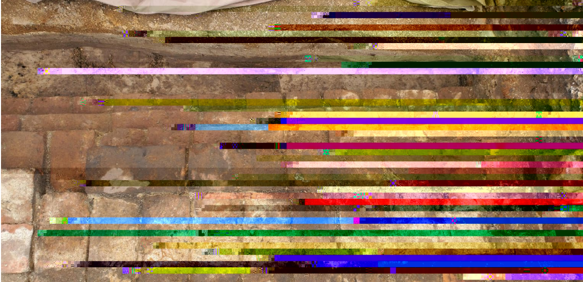
Feature 133 with crushed shell lining the Feature 104 builder's trench, possibly to prevent sinking in the sand and water table.